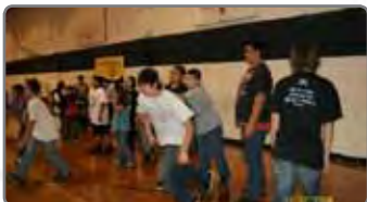
The youth enjoyed the games and learning to make healthy food choices.