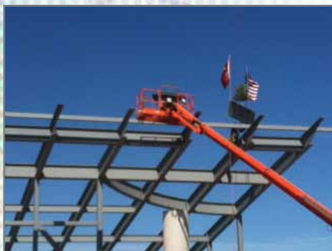
Beam being placed by crane

This ceremony is a very special and momentous occasion for the entire Absentee Shawnee Tribe. Thank You to those who were able to attend! The support for this new facility has been overwhelming and greatly appreciated. Be sure to join us for the Grand Opening in 2012!