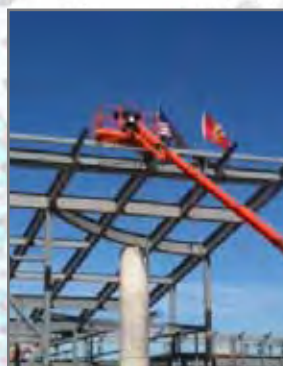
Beam mounting completed