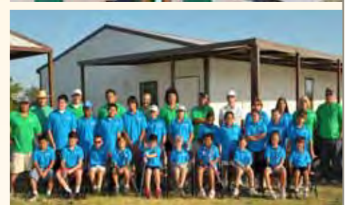
Horse Shoe Bend Golf Clinic Group Picture 1 st Annual Golf Clinic