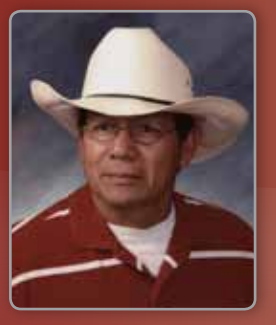
ISAAC GIBSON Lt. Governor