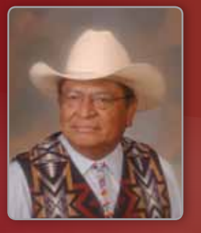
GEORGE BLANCHARD Governor