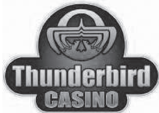
Table Games Manager

Must be energetic, customer orientated and dependable. Minimum 5 years Table Games Management experience required.