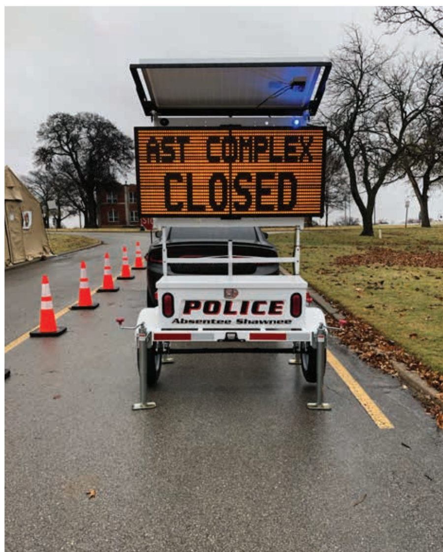
Absentee Shawnee Tribal complex is currently closed. Only essential staff are allowed on campus.

Larman had one final recommendation. The 3W's. Wear a mask. Wash your hands. Watch your distance.