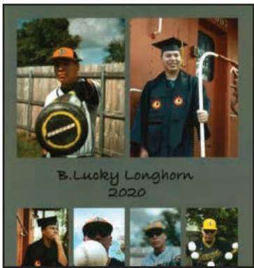
B. Lucky Longhorn