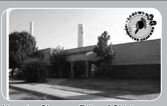
Absentee Shawnee Tribe of Oklahoma

Absentee Shawnee Tribe Complex Office of Environmental Health & Engineering, Building 13 If you have any questions, you can reach us by phone at (405) 214-4235