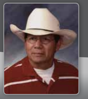
ISAAC GIBSON Lt. Governor